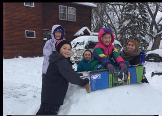
These innovative kids used a television box and come creativity to invent "hobo sledding" in 2017